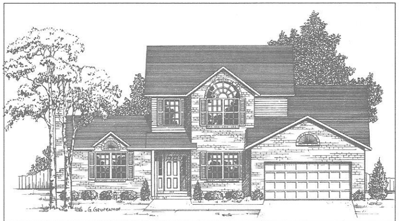
The Windsor Option B