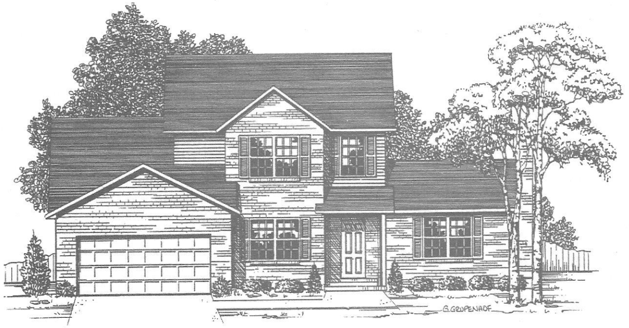
The Windsor Standard