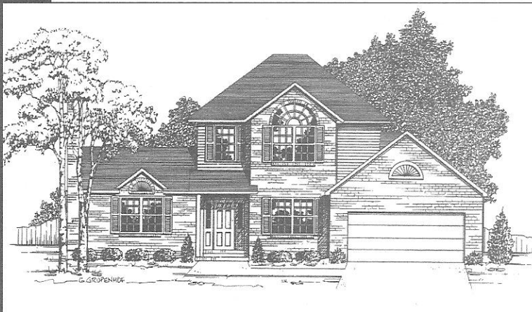
The Windsor Option A